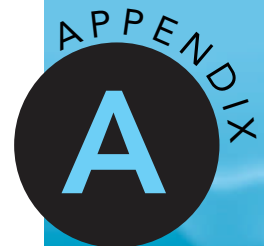
TABLE A.1 Conversion Factors